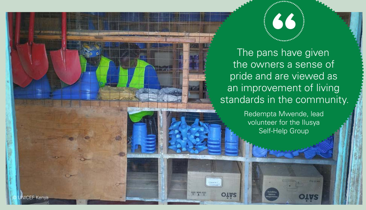
The Community Health Volunteers of the Self-Help Group take stock of their sales for the day.

STEP provided 3,718 school children with access to safe toilets, whilst creating demand for safe sanitation in the community. The program also built the capacity of school staff and the children in the promotion of hygiene, including menstrual health and hygiene.