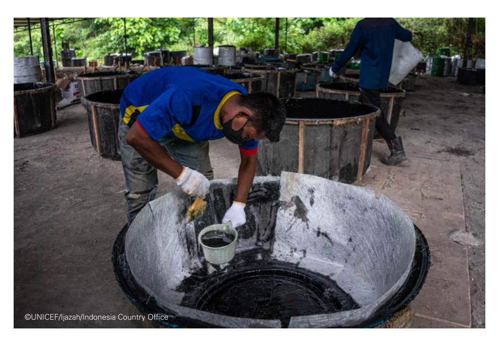
A local manufacturer builds a septic tank in Sumbawa Barat.

The final component of the MaS! partnership in Indonesia is leveraging financing options for market expansion so that both poor households and sanitation-related businesses can access affordable financing. A partnership between local sanitation service providers and a local bank in Bekasi has been developed, and an agreement signed. The agreement commits both to work towards the development of financial products for households and sanitation entrepreneurs (either manufacturers or service providers).