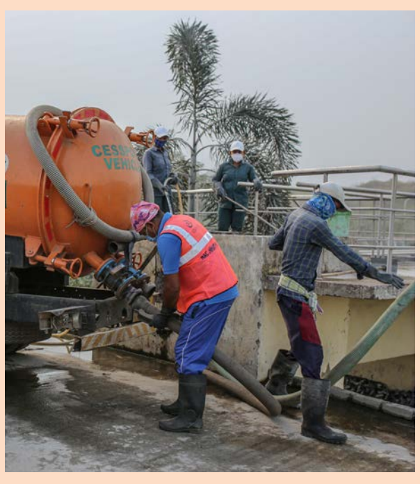
Swachhta Saathi unloads faecal sludge using a Cesspool vehicle inside a Faecal Sludge Treatment Plant (FSTP) at Ganjam District in Odisha.

To date, approximately US$1.22 million has been disbursed to nearly 8,000 self-help groups as loans for WASH financing in the state. The funding has come from the Odisha Livelihood Mission, a government department, in collaboration with key government WASH programmes, including the Swachh Bharat Mission (for sanitation) and the Jal Jeevan Mission (for water supply). This project has now been integrated with the MaS! partnership in Odisha.