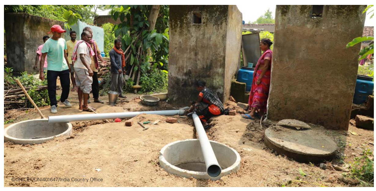
Toilets are being retrofitted in Odisha.

The partnership strengthened data and information in the sector by developing a local WASH management information system in Odisha. Advocacy with the state government is ongoing to integrate it into government data systems that will improve planning and targeting investments. In Bihar, a web/mobile-based application has been developed and piloted at the district level to help monitor safe sanitation behaviour, track infrastructure (including breakdowns) and measure the impact of the sanitation services.